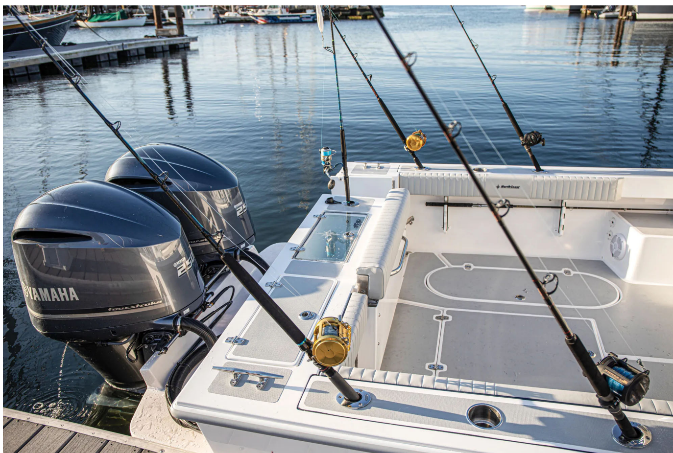
Twin 139-quart macerated fish boxes reside in the sole.